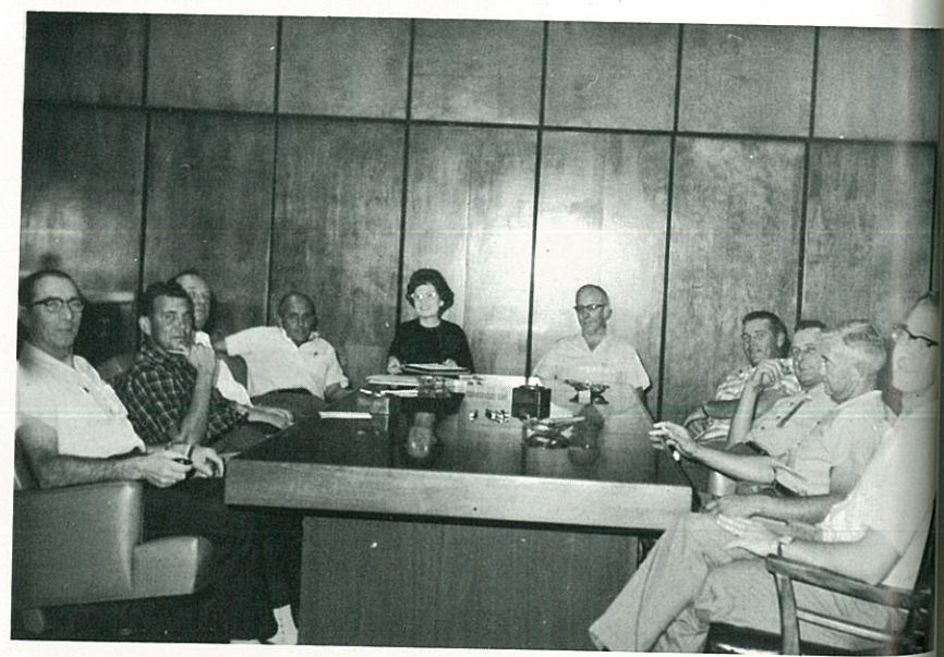
The board gathers for action in the new board room.